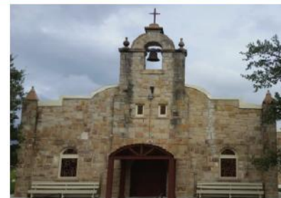
Sacred Heart Catholic Church Campbellton, Texas