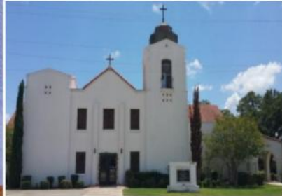
St. Andrew Catholic Church