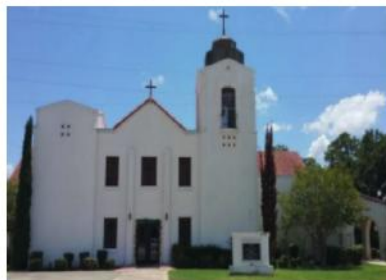
St. Andrew Catholic Church Pleasanton, Texas

blessed are those who have not seen & have BELIEVED