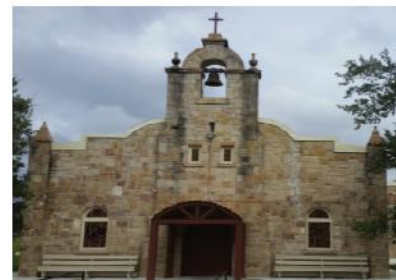
Sacred Heart Catholic Church Campbellton, Texas

St. Andrew Parish, a Eucharistic, faith community, dedicated, committed, and responding to God's call, to proclaim and share Christ's merciful and abundant love, through service and example.