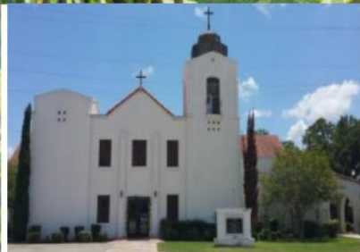
St. Andrew Catholic Church

Bendito El QUE VIENE EN EL NOMBRE DEL SEÑOR