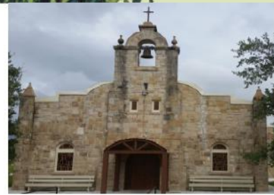
Sacred Heart Catholic Church

St. Andrew Parish, a Eucharistic, faith community, dedicated, committed, and responding to God's call, to proclaim and share Christ's merciful and abundant love, through service and example.