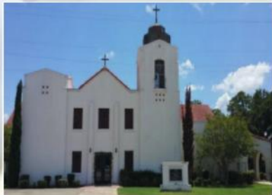
St. Andrew Catholic Church Pleasanton, Texas