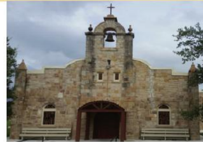
Sacred Heart Catholic Church Campbellton, Texas