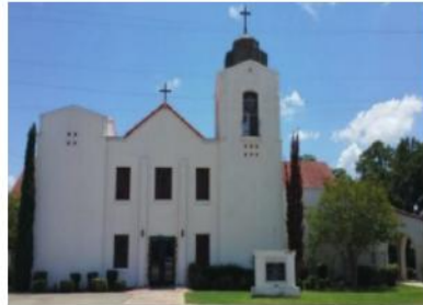
St. Andrew Catholic Church Pleasanton, Texas