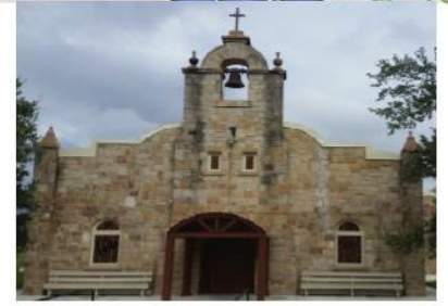
Sacred Heart Catholic Church Campbellton, Texas