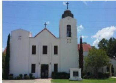
St. Andrew Catholic Church Pleasanton, Texas