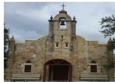
Sacred Heart Catholic Church Campbellton, Texas