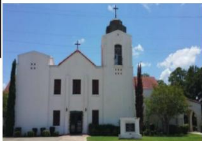
St. Andrew Catholic Church Pleasanton, Texas