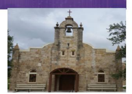
Sacred Heart Catholic Church