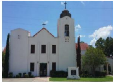
St. Andrew Catholic Church Pleasanton, Texas