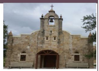
Sacred Heart Catholic Church