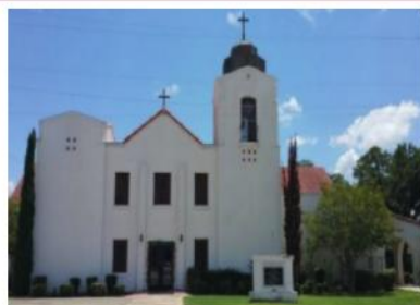
St. Andrew Catholic Church Pleasanton, Texas