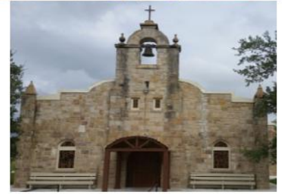
Sacred Heart Catholic Church Campbellton, Texas