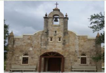
Sacred Heart Catholic Church Campbellton, Texas