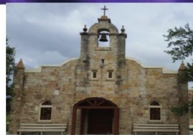
Sacred Heart Catholic Church Campbellton, Texas