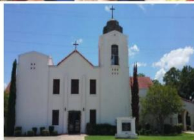
St. Andrew Catholic Church Pleasanton, Texas