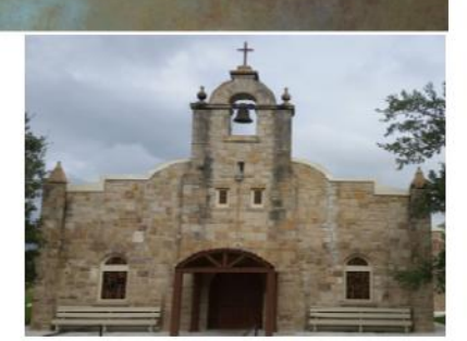
Sacred Heart Catholic Church