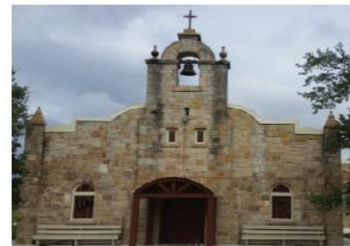
Sacred Heart Catholic Church Campbellton, Texas