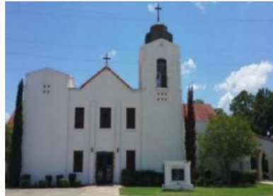
St. Andrew Catholic Church Pleasanton, Texas

“Vengan a mí los que van cansados, llevando pesadas cargas, y yo los aliviaré.” Mateo 11:28