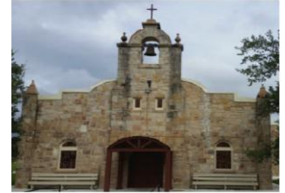
Sacred Heart Catholic Church Campbellton, Texas