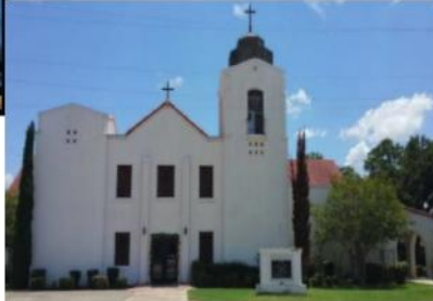
St. Andrew Catholic Church Pleasanton, Texas