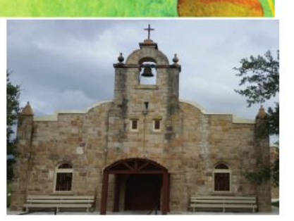
Sacred Heart Catholic Church Campbellton, Texas