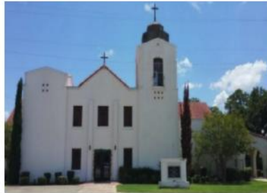
St. Andrew Catholic Church Pleasanton, Texas