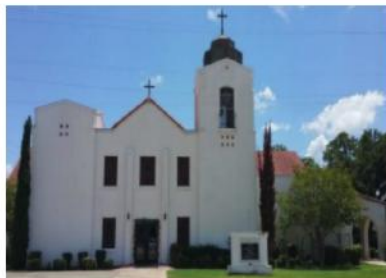
St. Andrew Catholic Church Pleasanton, Texas

"Lo que yo les digo en la oscuridad, repítanlo ustedes a la luz..." -Mateo 10, 27