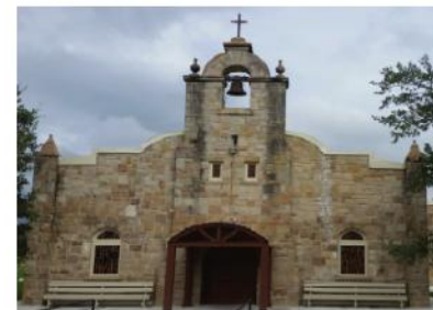
Sacred Heart Catholic Church Campbellton, Texas