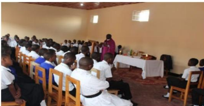
Students are attending Mass