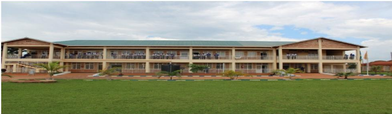
A new Catholic high school which teaches computer science

Catholic education has proven to be an effective means of evangelization and conversion of the youth's hearts for the bright future of the country. The financial support from you our brothers and sisters in Christ will help us in water project, to add more classrooms, to buy computers, books and school supplies, and it will enable us to carry on our mission of making the love of Christ present to the people of Rwanda. Currently the Diocese of Butare is establishing a Catholic high school for 500 students which teaches computer science for which we are asking for your support. These are some of the photos of the school and students. If you need more information about the school visit: https://msgrefelicienmubiligitss.com .