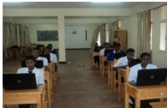
Students are in the classroom.