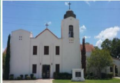
St. Andrew Catholic Church