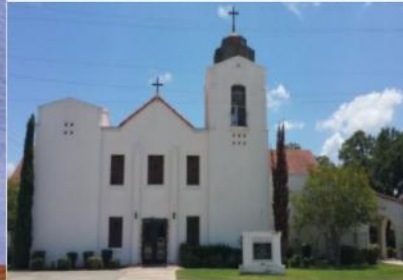
St. Andrew Catholic Church