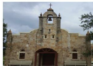
Sacred Heart Catholic Church Campbellton, Texas