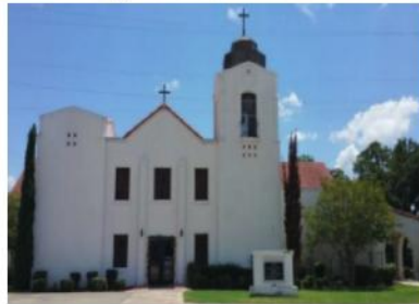
St. Andrew Catholic Church Pleasanton, Texas