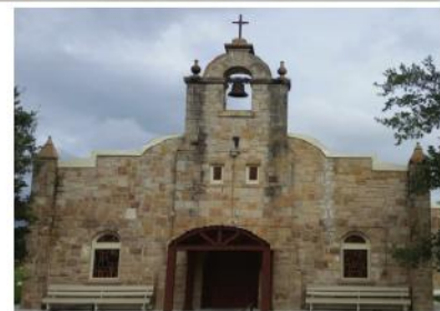
Sacred Heart Catholic Church Campbellton, Texas