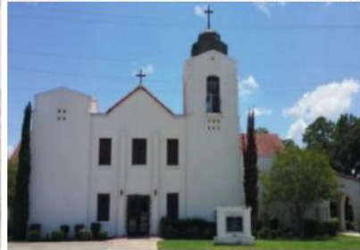
St. Andrew Catholic Church