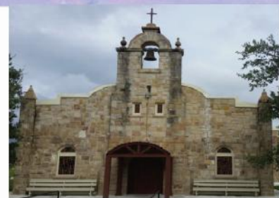
Sacred Heart Catholic Church

St. Andrew Parish, a Eucharistic, faith community, dedicated, committed, and responding to God's call, to proclaim and share Christ's merciful and abundant love, through service and example.