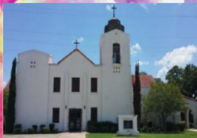
St. Andrew Catholic Church