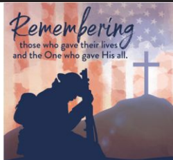
Remembering those who gave their lives and the One who gave His all.

The Parish Office will be closed on Monday, May 29th in observance of Memorial Day.