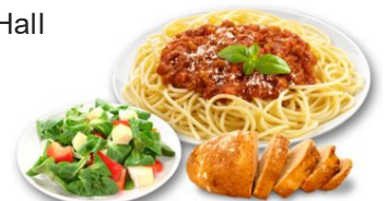
Plate includes Spaghetti with Meat Sauce, Salad and Garlic Bread!