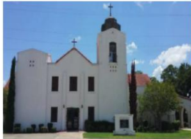
St. Andrew Catholic Church Pleasanton, Texas