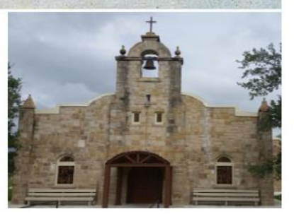
Sacred Heart Catholic Church Campbellton, Texas