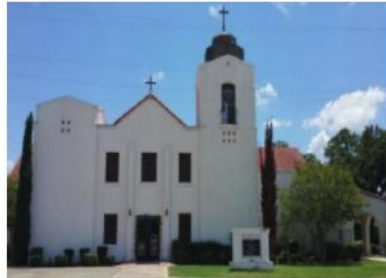
St. Andrew Catholic Church Pleasanton, Texas