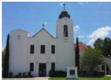
St. Andrew Catholic Church Pleasanton, Texas