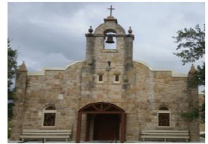
Sacred Heart Catholic Church Campbellton, Texas