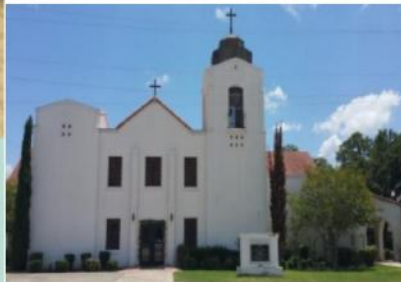
St. Andrew Catholic Church Pleasanton, Texas