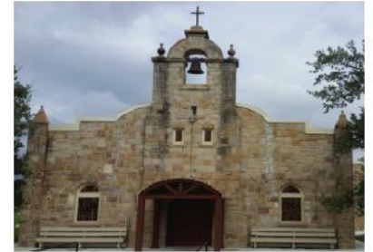
Sacred Heart Catholic Church Campbellton, Texas