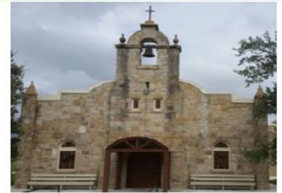
Sacred Heart Catholic Church Campbellton, Texas