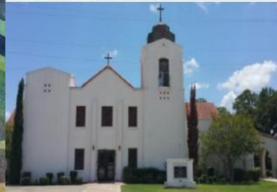
St. Andrew Catholic Church Pleasanton, Texas

QUE YO PUEDA SERVIR COMO siervo el Señor