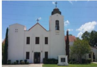
St. Andrew Catholic Church Pleasanton, Texas