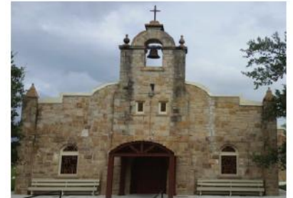
Sacred Heart Catholic Church Campbellton, Texas

St. Andrew Parish, a Eucharistic, faith community, dedicated, committed, and responding to God's call, to proclaim and share Christ's merciful and abundant love, through service and example.