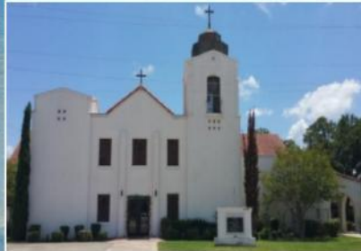
St. Andrew Catholic Church Pleasanton, Texas

El que no está CONTRA NOSOTROS, ESTÁ a favor de nosotros